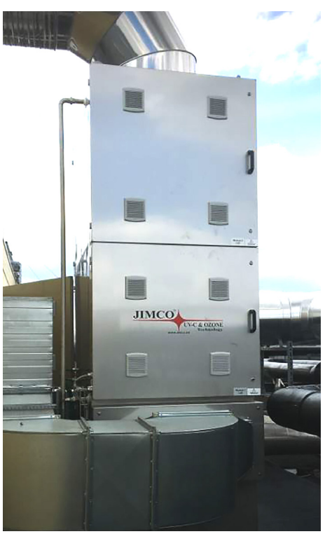
FLO-P with two doors 100 pcs. UV-C Lamps 81W or 165 W-HO lamps