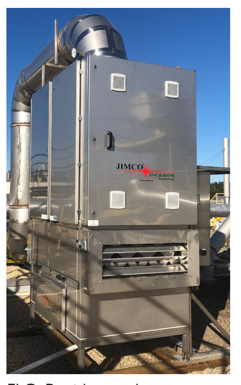
FLO-P with one door 60 pcs. UV-C Lamps 81W or 165 W-HO lamps