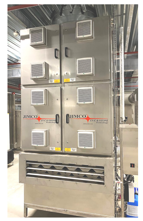
FLO-P with four doors 150 pcs. UV-C Lamps 81W or 165 W-HO lamps

Professional and environmentally friendly air purification of process air and odor control