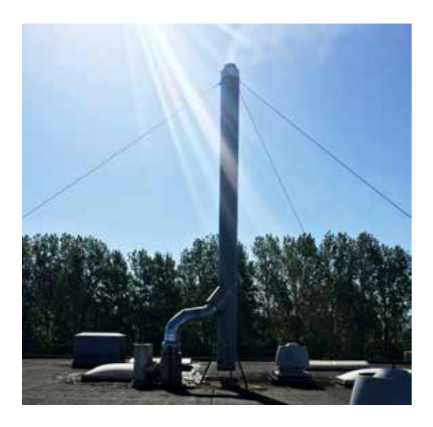
We have been using JIMCO's air purification system for over 20 years.

With the help of the FLO-P system, we are able to purify the air from our spring roll factory in an effective and environmentally friendly way.