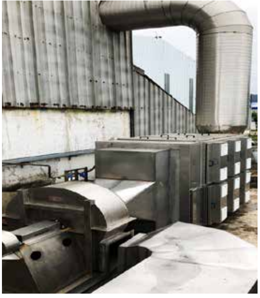
A fishery located in Calbuco, in the Los Lagos region.

The sources include an exhaust pipe connected to the JIMCO FLO-K system, which treats the exhaust air in two phases. First, UV light and ozone are used to reduce odors, and then a catalyst is employed to reduce the acidity of the exhaust air by converting H_2S into SO_2 .